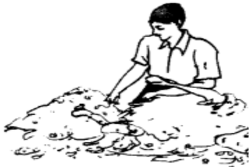
(a) Shearing a sheep (cutting the hair of sheep along with a thin layer of skin in one piece)

Finally, we conclude that the sheep's hair is sheared off from the body, scoured, sorted, dyed, combed and spun to obtain wool (for knitting sweaters) and woollen yarn (for weaving cloth). The quality of woollen cloth depends on the breed of sheep from which wool is obtained.