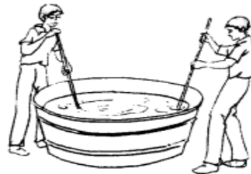
(b) Scouring in tanks