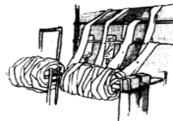
(d) Rolling into yarn